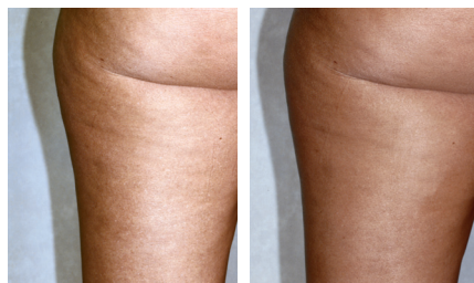
Before treatment, cellulite visible After treatment, cellulite reduced

Capillary and lymphatic circulation improvement can also assist with the treatment of cellulite. An extract of Chrysanthellum indicum can reduce edema and inflammation and promote tissue drainage and the elimination of toxins.